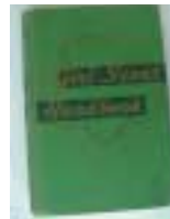
Girl Scout Handbook — Era 1949