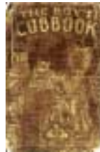
The Boy's Cubbook Part 1—Wolf 1930