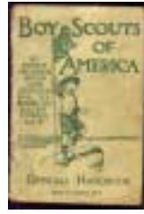
1910 Boy Scout Handbook

Once the temporary museum is functional, we will establish a committee to begin the work of acquiring a permanent facility. This facility will include all phases of Scouting, a hands-on learning room, a research library and teaching center. We want the "founders of Scouting" to tell the stories of the past and share their rich history.