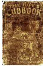
The Boy's Cubbook Part 1—Wolf 1930