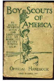
1910 Boy Scout Handbook

Our long term goal is to acquire a permanent facility to allow us to carry out our mission.